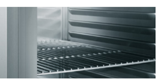
90mm insulation, hygienic interior with shelf tracks (570 MAGNOS series /590 MELIOS